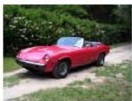
01-Jensen Healey and Jensen owners of Alabama

Jensen-Healey Preservation Photo Gallery » 01-Jensen Healey and Jensen owners of Alabama